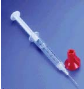
Syringe/needle Point-Lok device